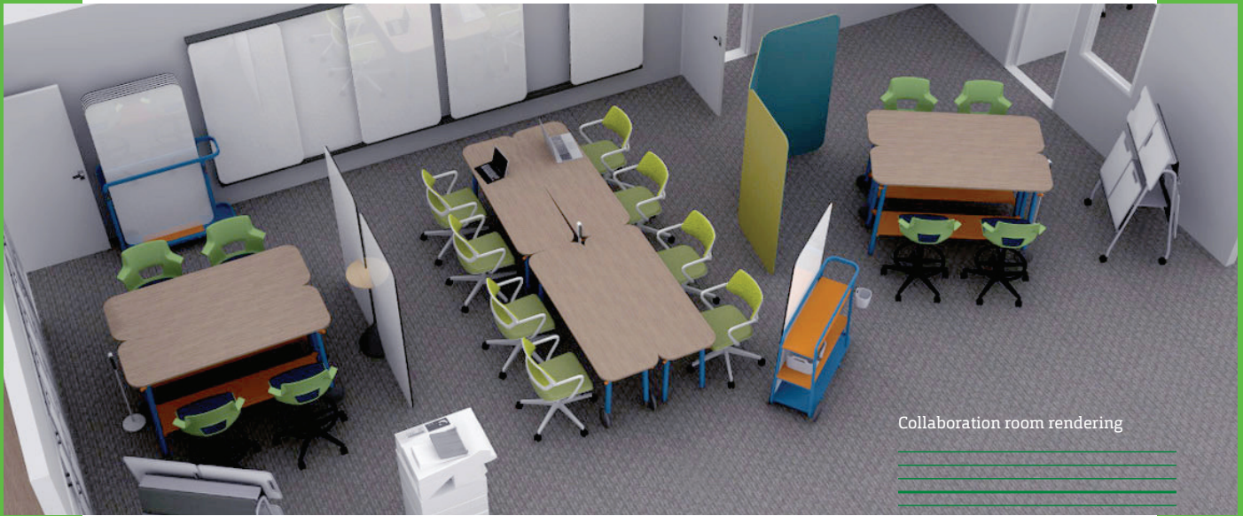
Collaboration room rendering